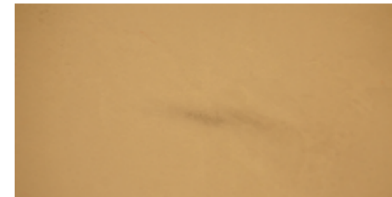
Watermark in Baxab Trigo.