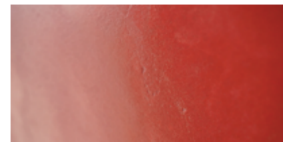
Textured detail in Microcemento Rojo.