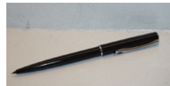
Detail of the hand-made corners.